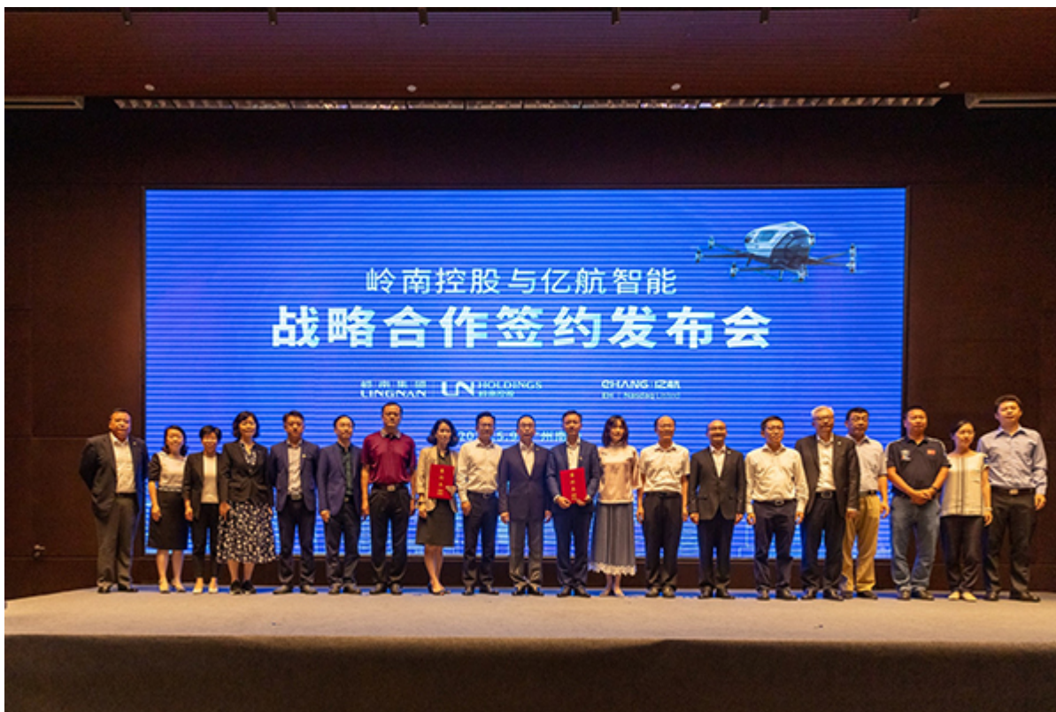
The signing ceremony of strategic partnership between EHang and LN Holdings

Guangzhou, China, May 11, 2020 -- EHang Holdings Limited (Nasdaq: EH) ("EHang" or the "Company"), the world's leading autonomous aerial vehicle ("AAV") technology platform company, announced that it has entered a strategic partnership with LN Holdings (000524.SZ), a Shenzhen-listed tourism platform company, to further commercialize its AAVs by integrating Urban Air Mobility ("UAM") solutions into the latter's hotel/tourism businesses. This collaboration will not only broaden the use cases for AAVs, but will also expand the partnerships in the existing ecosystem. As one of the collaboration initiatives, the introduction of EHang 216 AAV services into LN Garden Hotel will make it the world's first hotel to offer such services to its customers.