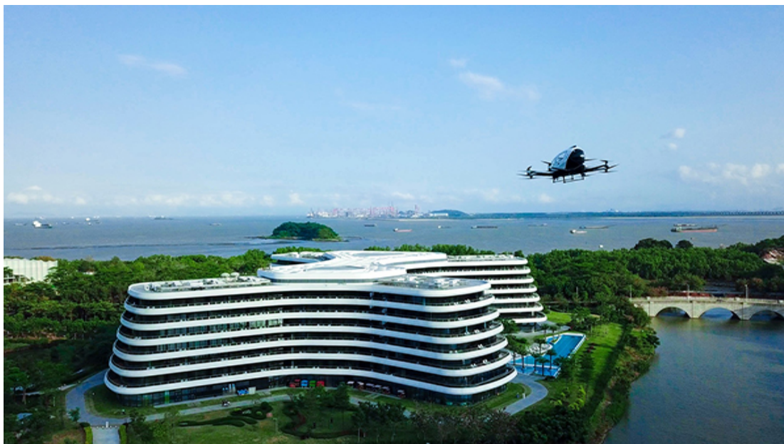
Eight journalists took rides on EHang 216 for aerial trips over LN Garden Hotel (To watch the video, please click here .)

The partnership between EHang and LN Holdings will start with a pilot program at the LN Garden Hotel in Nansha, a coastal district in Guangzhou, to build the world's first UAM theme hotel. The program will promote the innovative integration of aerial sightseeing, traveler transportation, air logistics, aerial media light shows, intelligent exhibitions and education. It will also promote the new experience of air tourism and explore other commercial use cases for EHang AAVs.