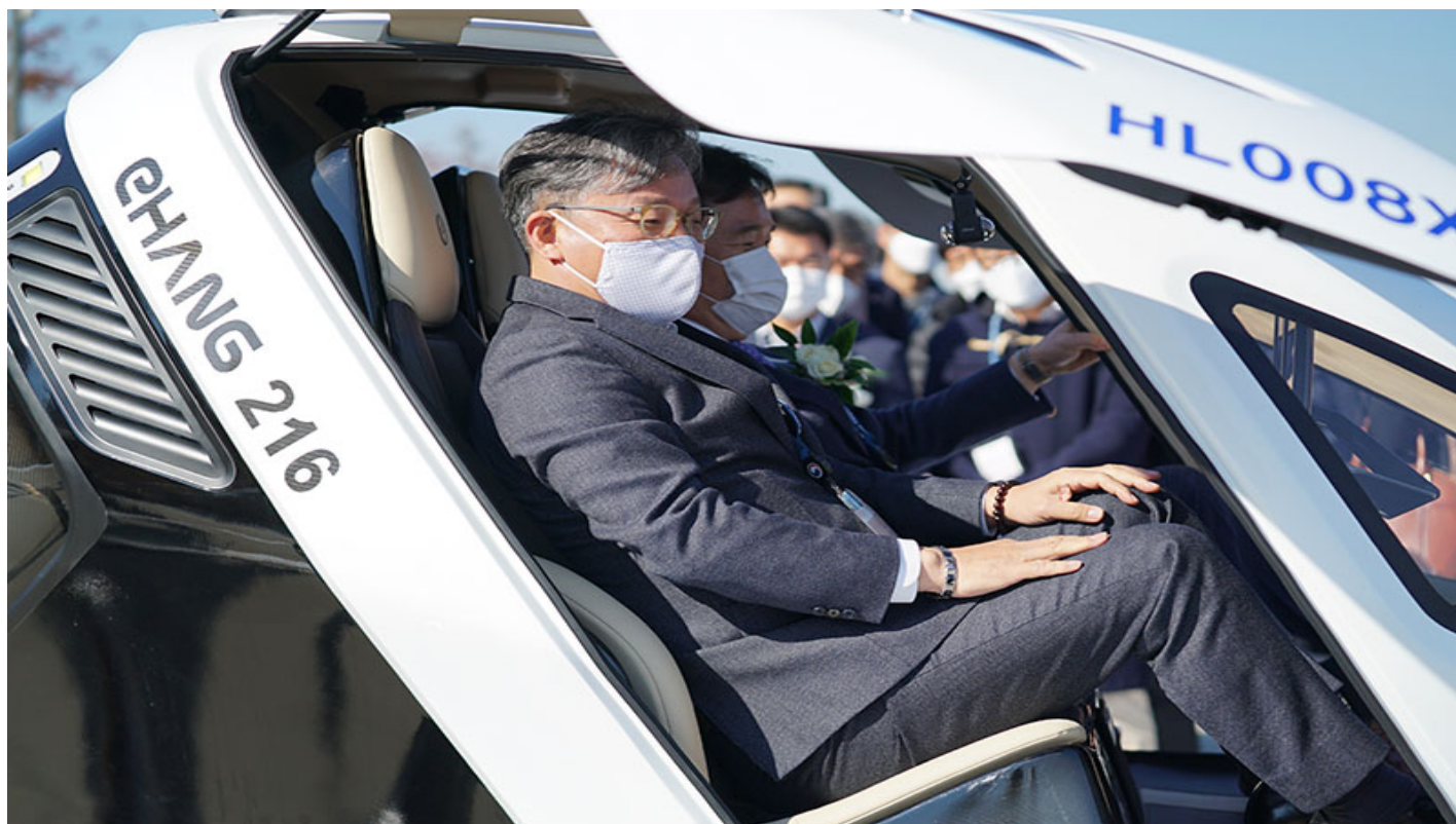
Son Myoung Soo, the Vice Minister for MOLIT (left), Seo Jeong-hyup, the Acting Mayor of Seoul (right)

The Acting Mayor of Seoul, Seo Jeong-hyup said, "The air taxi is a dream of mankind for the future transportation. We are excited that Seoul can host the country's first domestic demo flight. Seoul is pioneering itself as an innovative hub of the world. Urban air mobility services are drawing keen attentions as an option to alleviate ground traffic congestions with a huge potential for growth. The city government will strive to realize the human dream of safe flights for Seoul citizens and thus support the future industry of Korea."