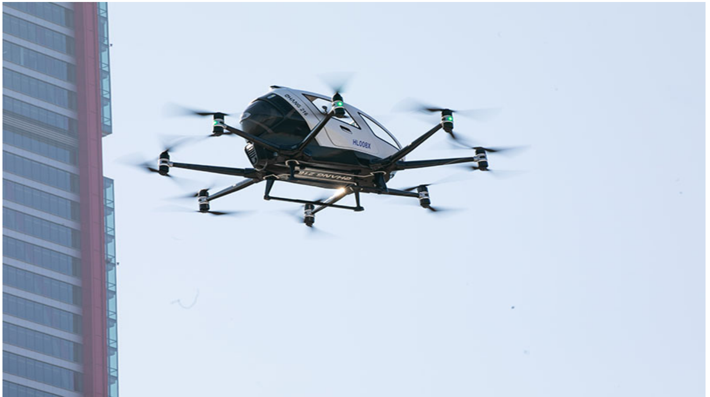
EHang 216 completed its first-ever trial flight in Korea

The maiden flight was approved by Korea's MOLIT after obtaining a Special Certificate of Airworthiness ("SAC") for the EHang 216 AAV, a first SAC ever issued to a passenger-grade AAV.