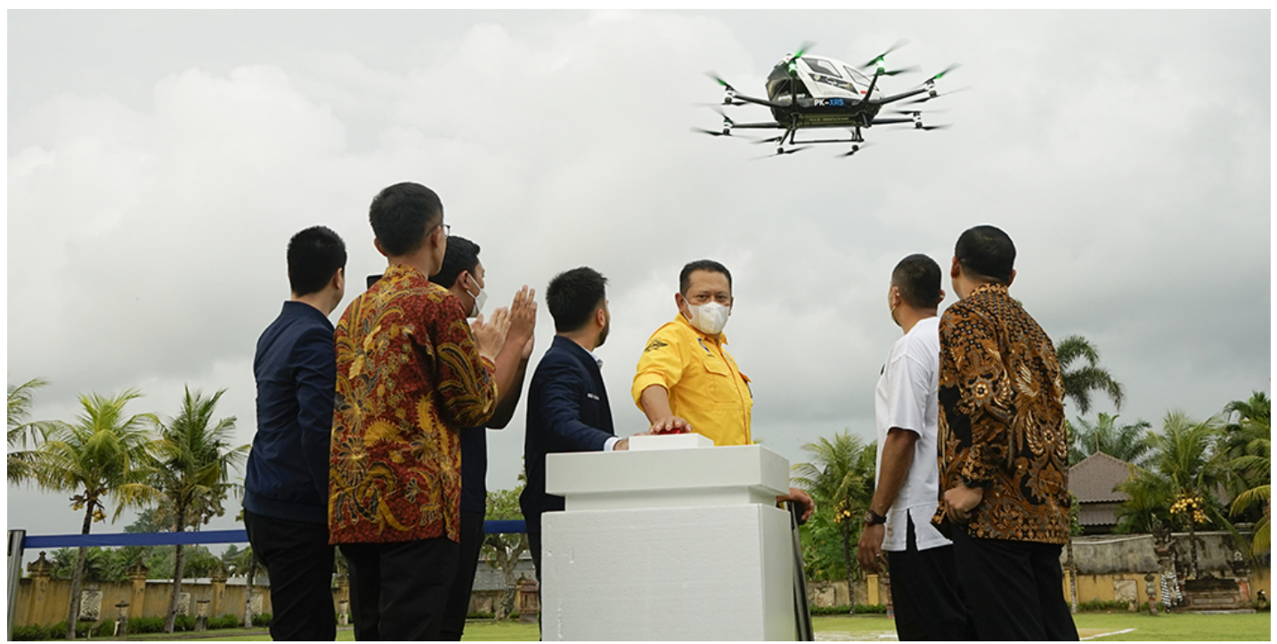
VIP guests watch the EHang 216 demo flight

Prior to the flight demo, the Directorate General of Civil Aviation of the Republic of Indonesia issued the Special Certificate of Airworthiness for the EHang 216 AAV, enabling it to be the Indonesia's first passenger-grade AAV approved for a public unmanned flight demo.