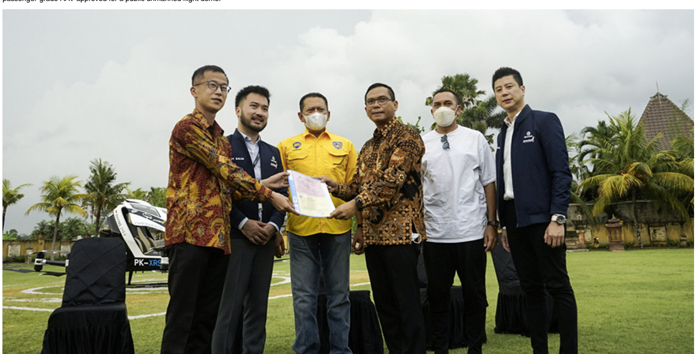
The Director General of Civil Aviation of the Republic of Indonesia issues the Special Certificate of Airworthiness for the EHang 216.

Prior to the flight demo, the Directorate General of Civil Aviation of the Republic of Indonesia issued the Special Certificate of Airworthiness for the EHang 216 AAV, enabling it to be the Indonesia's first passenger-grade AAV approved for a public unmanned flight demo.