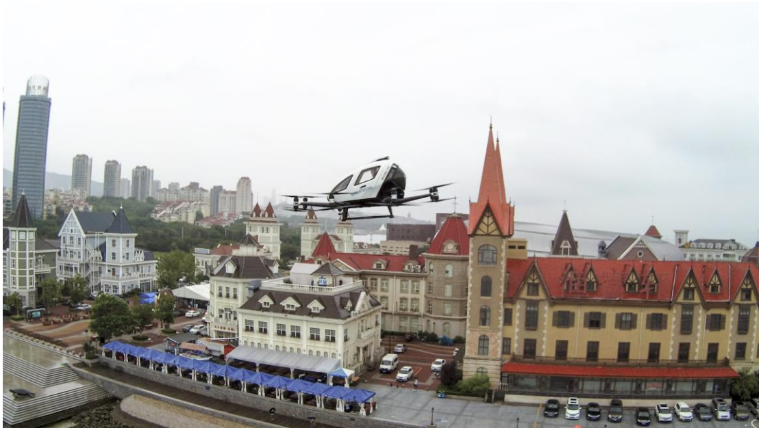
(Passengers took EHang 216 for aerial sightseeing trips in Yantai, a city in east China.)

Yantai, China, July 14, 2020 -- EHang Holdings Limited (Nasdaq: EH) ("EHang" or the "Company"), the world's leading autonomous aerial vehicle ("AAV") technology platform company, announced today the aerial sightseeing trial flights in Yantai, a coastal city in East China. An EHang 216 took four passengers to the air for aerial sightseeing trips over the sea around the beautiful Fisherman's Wharf in Yantai city, one of the many AAAA national tourist attraction locations throughout China.